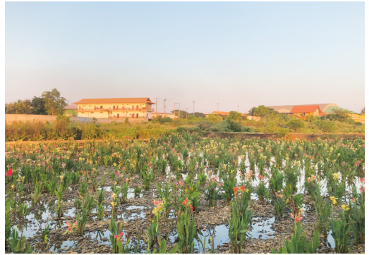
Constructed Wetlands for Wastewater Treatment Paoy Village, Houysaiy, Lao PDR