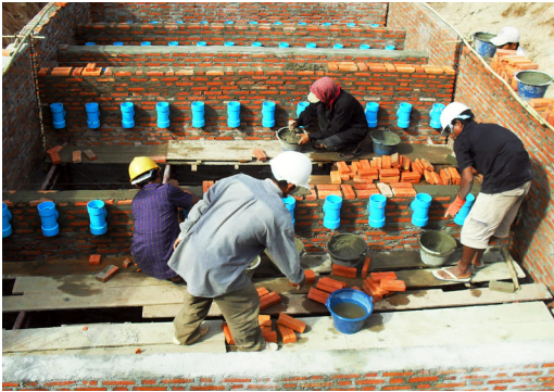
Decentralised Wastewater Treatment System (DEWATS) Kampong Speu Referral Hospital, Cambodia