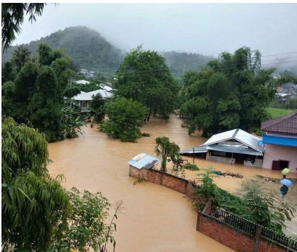
Sam Neua, Lao PDR (BORDA, 2022)

Practical implementation is being emphasized through demonstration projects. Institutional and municipal staff capacities of the target communities are strengthened.