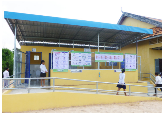
School Based Sanitation (SBS) Tekhak Panh Nhor Primary School, Phnom Penh, Cambodia