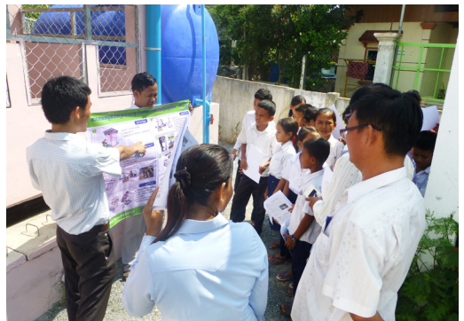
Operation and Maintenance (O&M) Campaign Srae Nhor Primary School, Dong Kor District, Phnom Penh, Cambodia