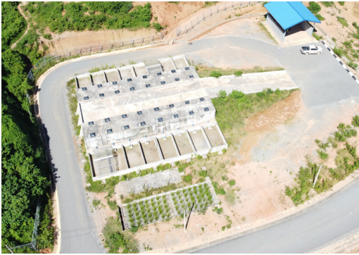
Fecal Sludge Treatment Plant (FSTP) Mai Village Landfill, Louang Namtha, Lao PDR