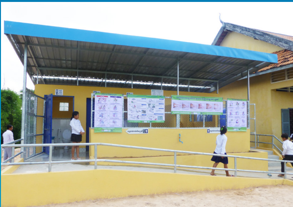
School Based Sanitation (SBS) Tekhak Panh Nhor Primary School, Phnom Penh, Cambodia