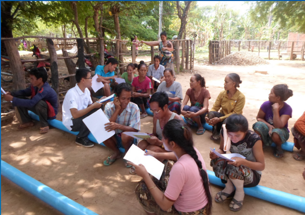
Health Impact Evaluation (HIE) Mixai Village, Sanxai District, Attapue Province, Lao PDR