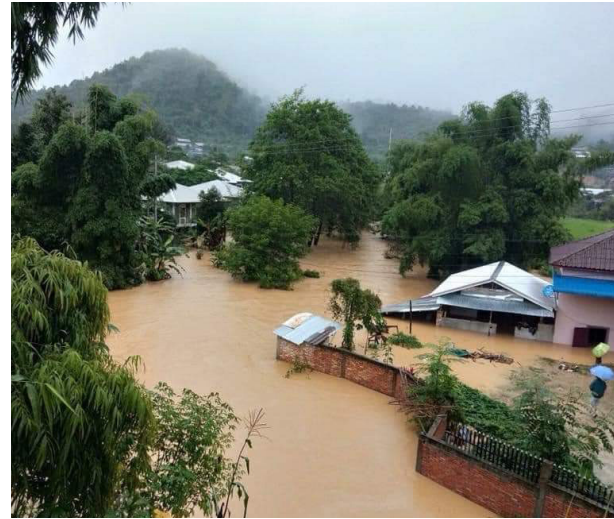
Sam Neua, Lao PDR (BORDA, 2022)

Urban neighborhoods are facing tremendous challenges due to an increasing vulnerability to water-related issues and climate change.